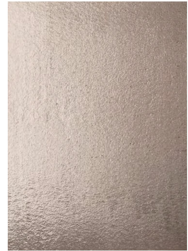
(D) TEXTURED POLISHED SURFACE