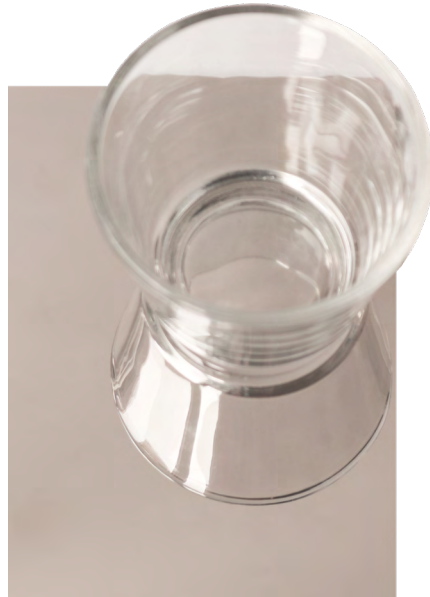
(A) SLEEK MIRRORED SURFACE

Any finish can be applied to both the tabletop and the body. The two surfaces can be treated the same way or in different finishes, to create a particular contrast to the piece and a very hard and resistant final surface.