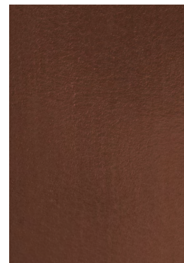
(F) TEXTURED SURFACE AND DARK BLACK PATINA