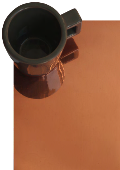
(A) SLEEK MIRRORED SURFACE