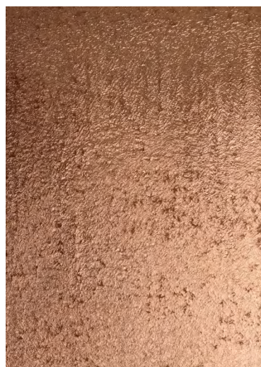
(D) TEXTURED POLISHED SURFACE