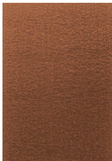
(E) TEXTURED SURFACE, BLACK PATINA AND POLISH TREATMENT