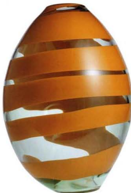
Vase, Spring Megalit Emmanuel Babled Hand-blown glass H: 50cm (19 3/4in) Diam: 40cm (15 3/4in) Venini SpA, Italy www.venini.com