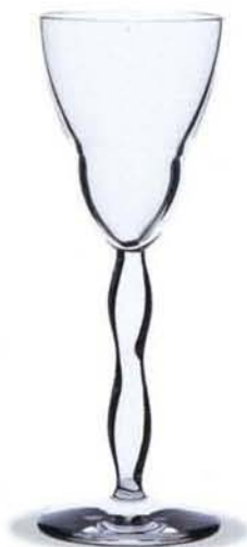
Glass, Stream Emmanuel Babled Crystal H: 22cm (8 1/2in) Baccarat, France www.baccarat.fr