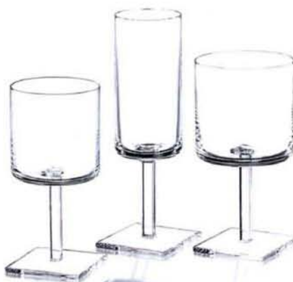
Goblets, Laetitia Michele De Lucchi with Alberto Nason Lead crystal with over 24% PbO Various dimensions Arnolfo di Cambio – Compagnia Italiana del Cristallo SpA, Italy www.arnolfodicambio.com