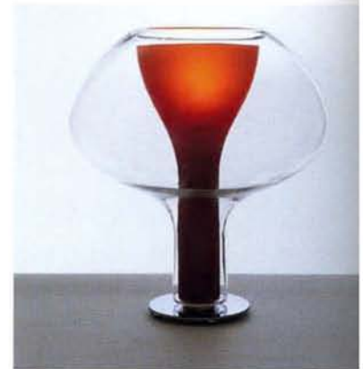
Table lamp, Kovac Lamp

Paolo Ulian Aluminium, Pyrex 1 x 150W bulb H: 60cm (23 1/2in) Diam: 27cm (10 1/2in) Luminara, Italy www.luminara.it