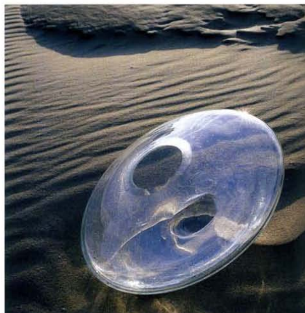
Vase, UFO L'Anverre Glass H: 25cm (9 7/8in) Diam: 50cm (19 1/2in) L'Anverre, Belgium www.lanverre.com