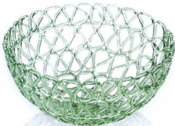
Bowl, Fresh Fat Tom Dixon Extruded woven plastic H: 33cm (13in) Diam: 66cm (26in) Tom Dixon, UK www.tomdixon.net