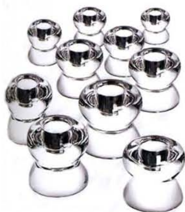
Candleholder, Punch Karim Rashid Lead crystal with over 24% PbO H: 11.3cm (4 1/2in) D: 17cm (6 1/2in) Arnolfo di Cambio – Compagnia Italiana del Cristallo SpA, Italy www.arnolfodicambio.com