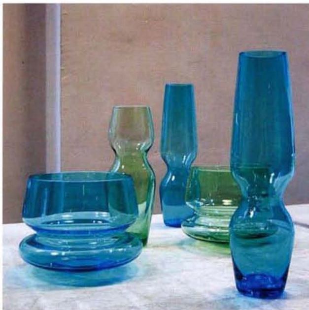
Vase, Memore Konstantin Grcic Lead crystal with over 24% PbO H: 31cm (12 1/4in) W: 10cm (3 7/8in) D: 12.5cm (4 7/8in) Arnolfo di Cambio – Compagnia Italiana del Cristallo SpA, Italy www.arnolfodicambio.com